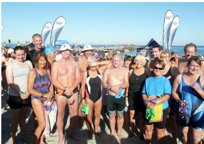
Ramos swimmers ready to walk to the starting points. (MORE PHOTOGRAPHS ARE AVAILABLE ON THE LATEST NEWS SECTION ON CLUB WEBSITE)