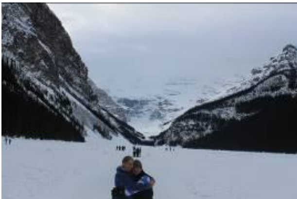
Walked out on Lake Louise, (Obligatory Canada shot)