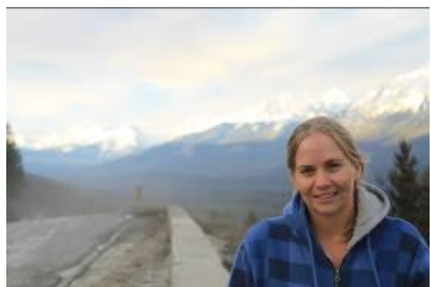
On the side of the road in BC somewhere

It barely snowed in Canada in Jan and Feb while we were there, so we did little skiing and lots of driving to places to see if the hills were any good there. We also took a side trip into Las Vegas, which was an insane experience, worth it but probably never again! Including dashing through American customs attempting to make a connection flight with 4 blokes, we hit a swim show while we were there which was pretty incredible!