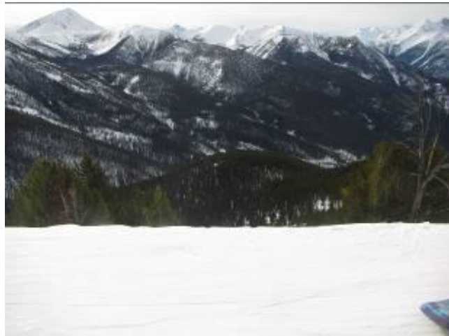
Sunshine Mountain, Alberta