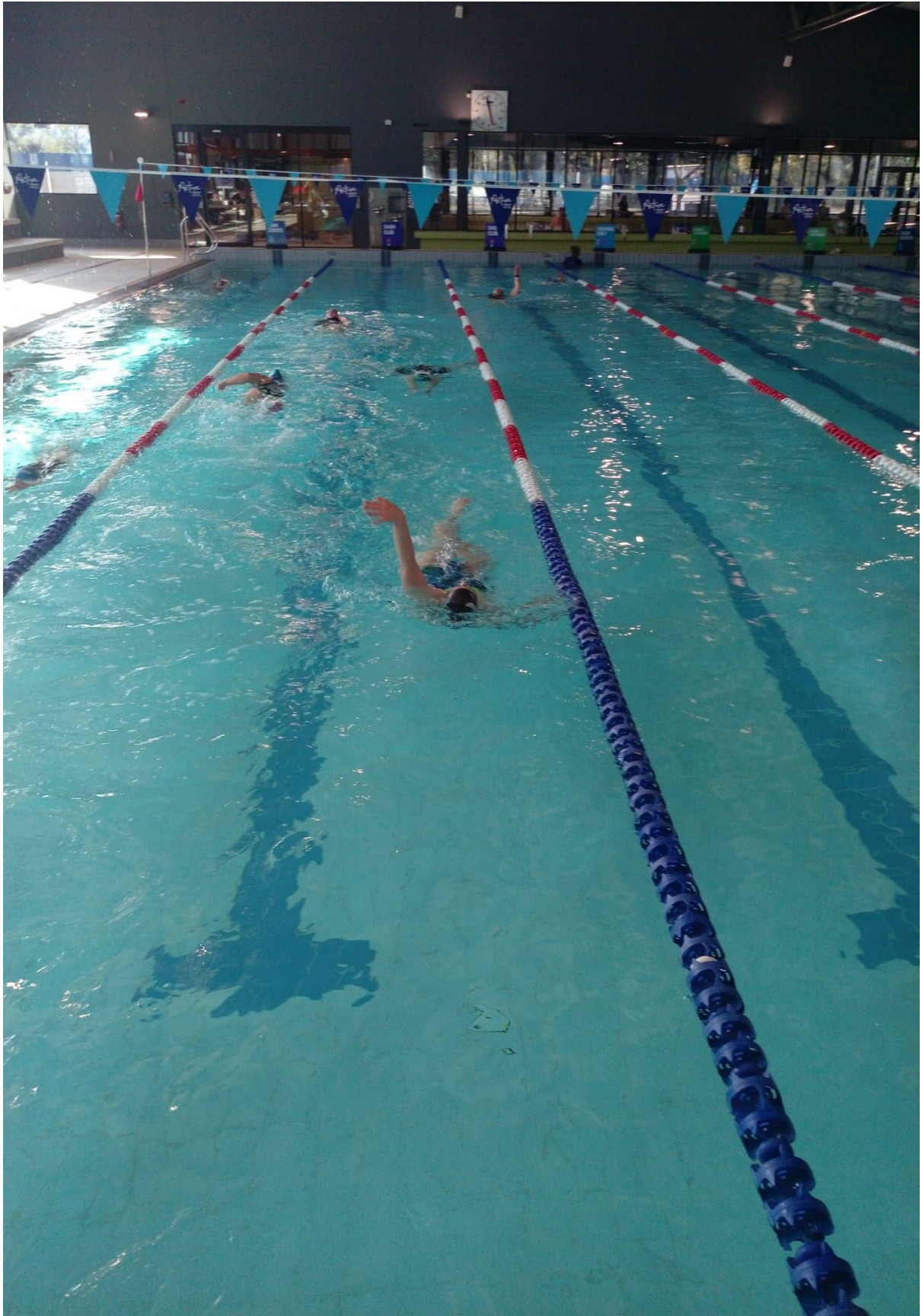
At a recent Saturday morning training session, in the indoor pool. Other swimmers chose to train in the outdoor 50m pool.